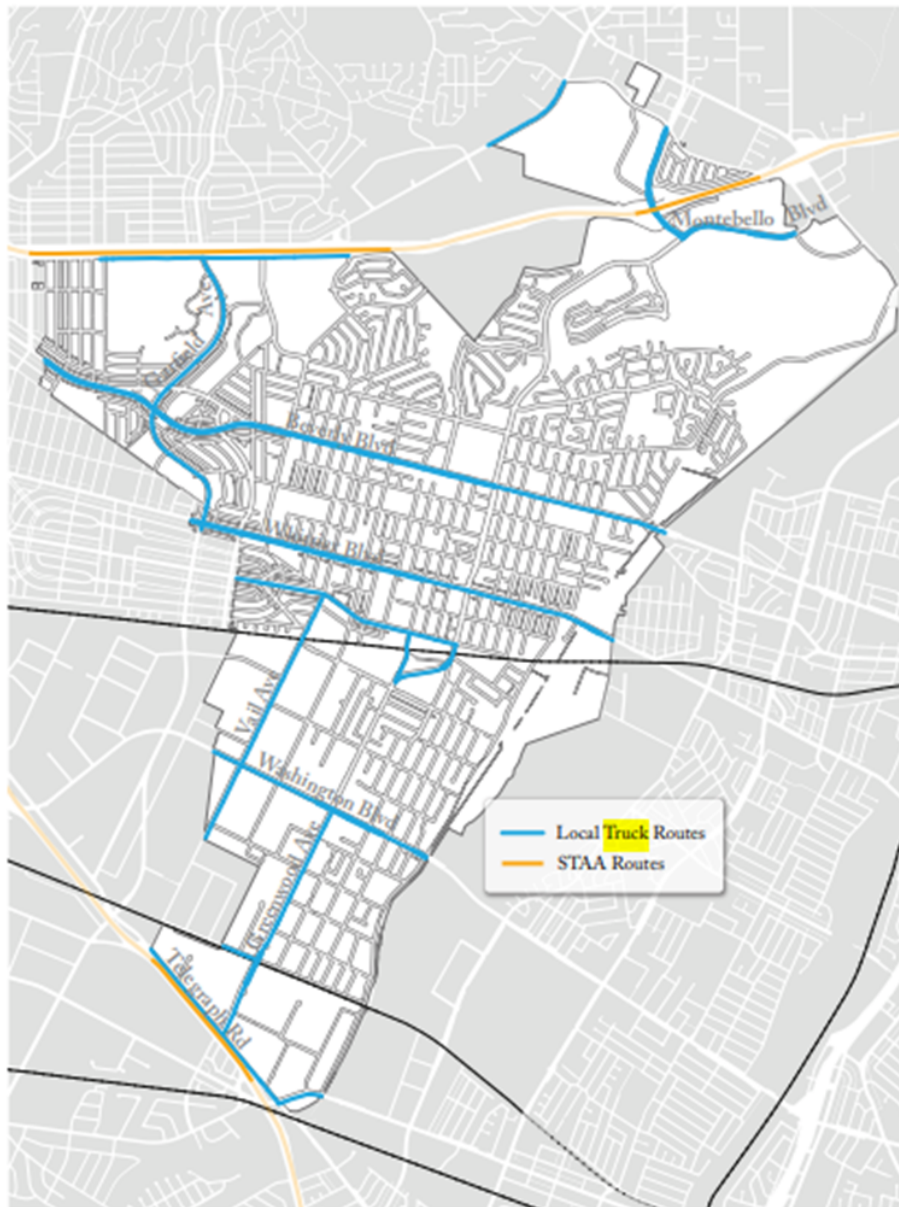
Figure 1 – Truck Route Map

Truck Routes are discussed in the City of Montebello's adopted General Plan Section 3.0 Goods Movement Network - Part C, 4. Our Accessible Community Page 133 (Attachment B). The General Plan provides guidance for truck route locations in the City, taking into consideration the location of existing and future businesses that may require trucking services, while at the same time avoiding unnecessary impacts to sensitive land uses in the area. In addition, several specific plans in the City compliment the General Plan's transportation element by identifying truck route designations within each specific plan